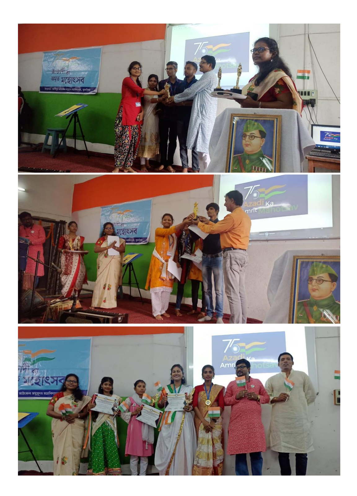
Distribution of prizes and replica of the National Flag