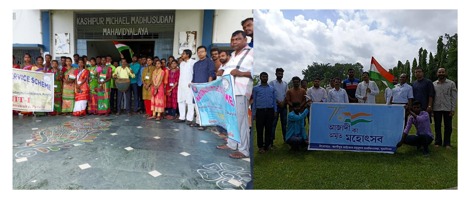
Preparing for the procession to commemorate the journey of 75 years of India's Independence